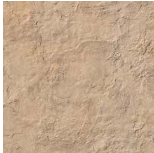
Island AD 02 NAT*