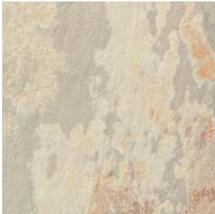
Shore AD 01 NAT