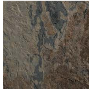
African Stone AD 03 NAT*