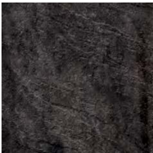
Black Reef AD 04 NAT