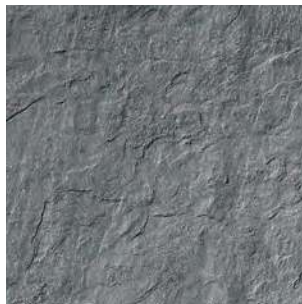
Vulcan AD 05 NAT*